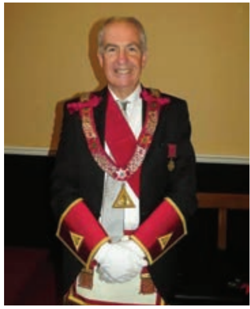
M, E Comp. Guy St Leger following SGRAC installation as Grand High Priest recently.