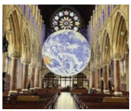
Gaia Globe" in Cobh Cathedral.