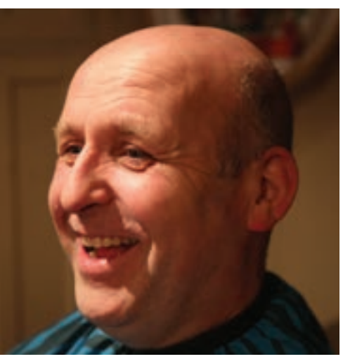
"it's all for a good cause ."

Thanks to everyone who participated in Movember this year and to all the brethren who sponsored them in their endeavours, all your families must be delighted to see the back of the hairy caterpillar from your upper lip. Thank you to all the members of the green committee for all their help to make the night happen.