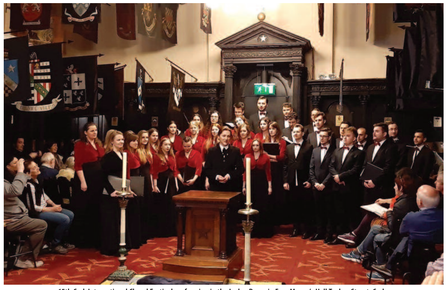
65th Cork International Choral Festival performing in the Lodge Room in Free Mason's Hall Tuckey Street, Cork,

Am I grateful for joining both groups and now having a vastly improved knowledge of meeting formats and, expected conduct. Yes, is the clear answer.